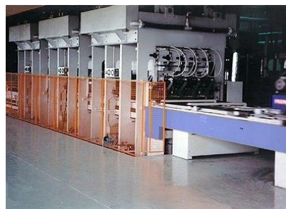
Press for large formats