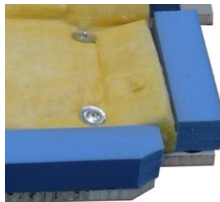
Detail view of underside