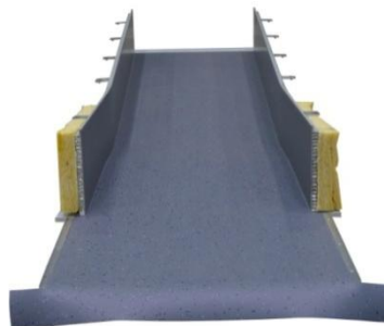
Connection of low and high-floor

With the assembly groups from EURO-COMPOSITES® the customer has reduced the time for the floor assembly by 75%.