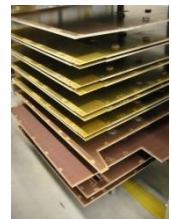
Drop-in parts after final control