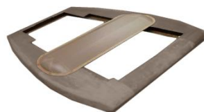
Pelmet (1,80 x 3,50 m) ceiling part