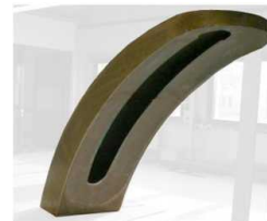
Stairhouse shown as part and in its final assembly state (right)