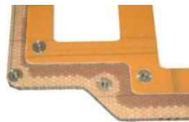
Part detail with edge closure, inserts and reinforcement laminate