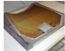
Core detail formed and machined from two sides