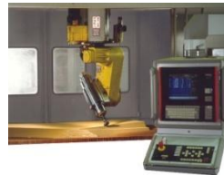
Machining of honeycomb