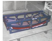
Heat-forming of Honeycombs