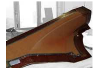
lightweight honeycomb part